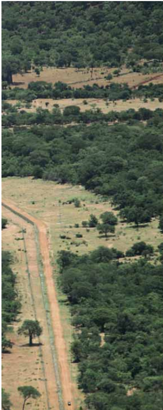
The secret mile-long airfield under construction near Zimbabwe's diamond fields.

Most people don't realise the sheer size and potential of Zimbabwe's Marange diamond fields. They cover a staggering 660 square kilometres, and though there are no scientific estimates, are rumoured by industry buzz to be able to yield some 40 million carats a year of diamonds that are on average of superior clarity and colour. In a world where the biggest diamond mines have peaked and are now sliding into production decline while no new mines have been discovered in years, they hold the potential to completely rewrite the future of some of the world's biggest diamond and jewellery companies.